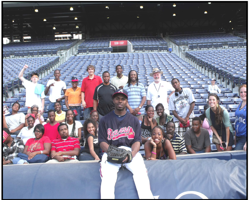
During batting practice, Braves player Michael Bourn , visited with the kids, signed autographs and posed for pictures.

Our club, once again during the 2011 season, participated in the Atlanta Braves "Reach Out Be Our Guest Program" by donating 500 tickets to allow underprivileged youngsters the opportunity to attend Braves games. The program is administered by the Atlanta Braves. Groups of children and their chaperones from the Salvation Army , Covenant House Georgia and the Georgia Sheriff's Youth Homes were among the attendees at games this year. The smile on the faces of the young folks is rewarding and they express their gratitude to the club for the tickets and the experience.